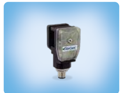
Plug amplifier PVY-02.